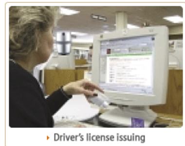
▶ Driver's license issuing

The digital presenter is also used to issue an ID card by capturing an image of customers or members. It captures images by scanning an existing photo or directly taking a picture of the customer. Clear image capture, quick image transmission to a PC and easy, flexible image adjustment make this device the most efficient solution for a variety of membership cards issuing applications.