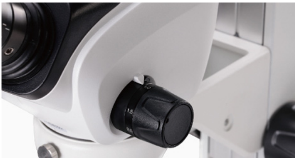
User can limit the zoom range as per self-choice.