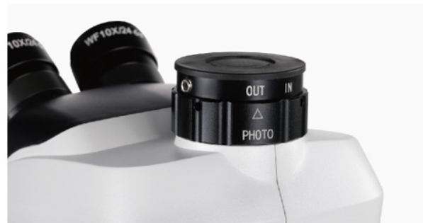
Rotating switching to video output and input, 100% light distribution.