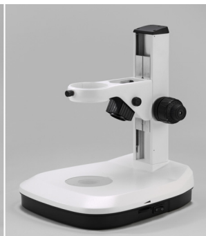
Focusing Arm Stand